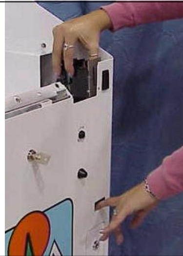
Inserting The Coin Wizard (Bottom)