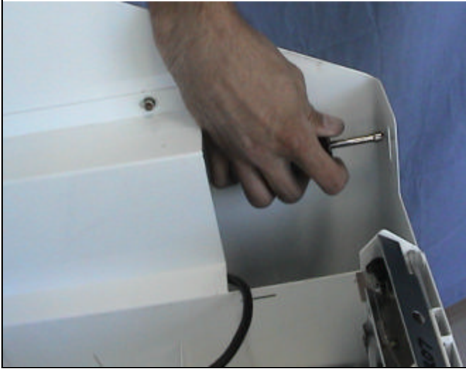
Tightening The Guide Pin Nut